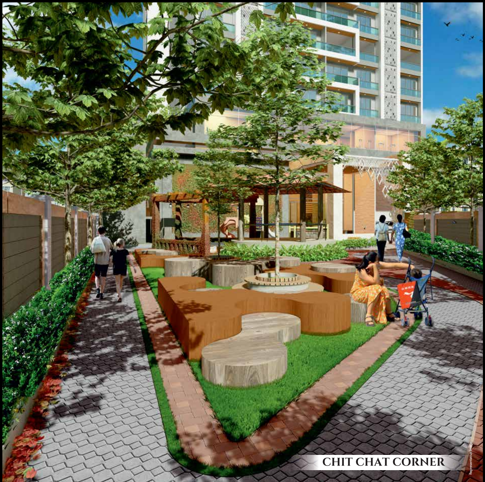
CHIT CHAT CORNER